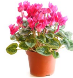
Cyclamen ($15 each) _____